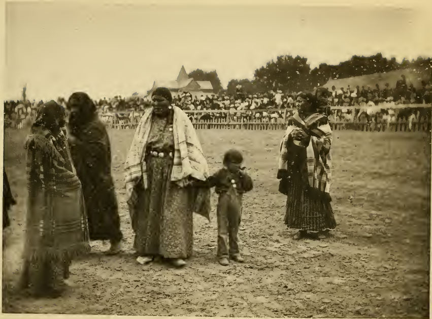
SQUAWS WATCHING DANCE.